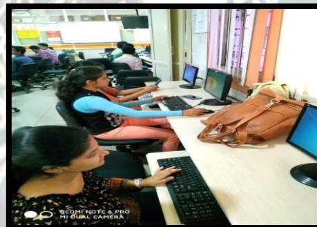
Students and faculty at Jetking Networking Centre